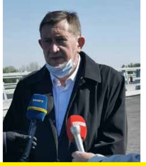
Minister Vojin Mitrović

Ministry of Communications and Transport of Bosnia and Herzegovina